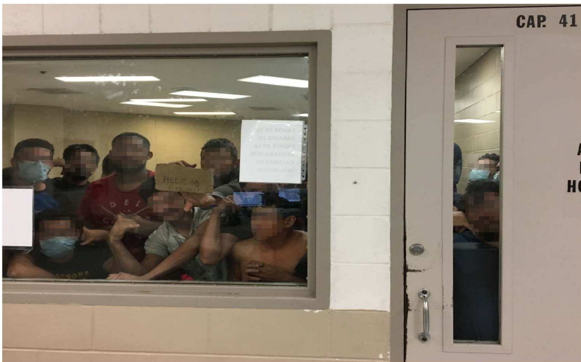
Figure 6. Eighty-eight adult males held in a cell with a maximum capacity of 41, some signaling prolonged detention to OIG Staff, observed by OIG on June 12, 2019, at Border Patrol’s Fort Brown Station.

Senior managers at several facilities raised security concerns for their agents and the detainees. For example, one called the situation “a ticking time bomb.” Moreover, we ended our site visit at one Border Patrol facility early because our presence was agitating an already difficult situation. Specifically, when detainees observed us, they banged on the cell windows, shouted, pressed notes to the window with their time in custody, and gestured to evidence of their time in custody (e.g., beards) (see figure 6).