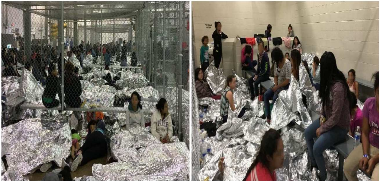
Figure 2. Overcrowding of families observed by OIG on June 11, 2019, at Border Patrol’s McAllen, TX, Centralized Processing Center.