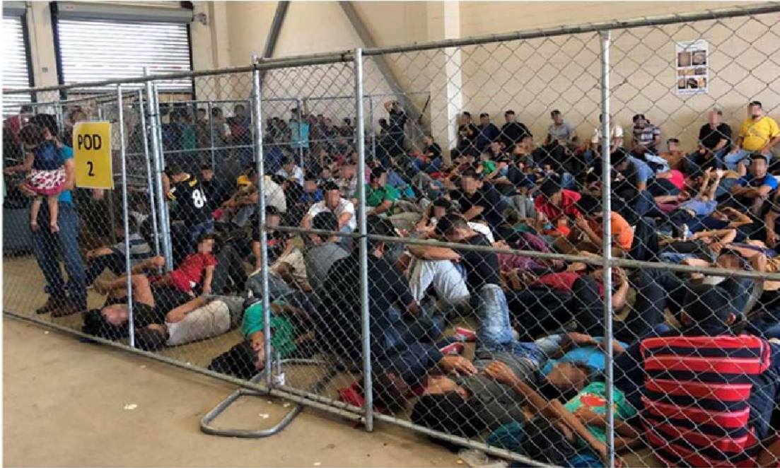
Figure 1. Overcrowding of families observed by OIG on June 10, 2019, at Border Patrol’s McAllen, TX, Station.