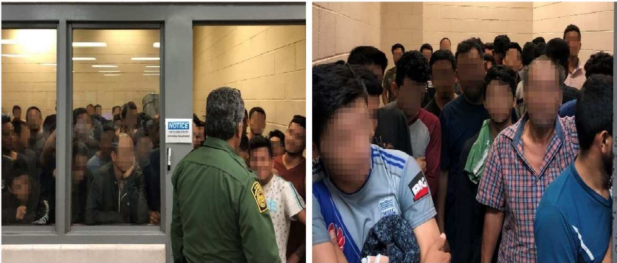
Figure 4. Standing room only for adult males observed by OIG on June 10, 2019, at Border Patrol’s McAllen, TX, Station.