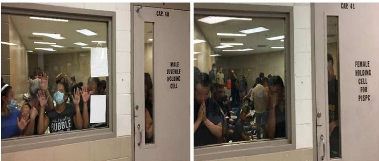
Figure 5. Fifty-one adult females held in a cell designated for male juveniles with a capacity for 40 (left), and 71 adult males held in a cell designated for adult females with a capacity for 41 (right), observed by OIG on June 12, 2019, at Border Patrol’s Fort Brown Station.

We are concerned that overcrowding and prolonged detention represent an immediate risk to the health and safety of DHS agents and officers, and to those detained. At the time of our visits, Border Patrol management told us there had already been security incidents among adult males at multiple facilities. These included detainees clogging toilets with Mylar blankets and socks in order to be released from their cells during maintenance. At one facility, detainees who had been moved from their cell