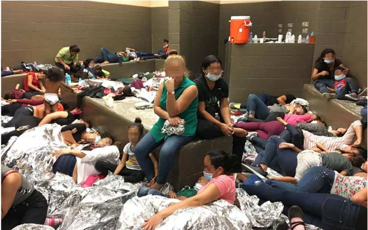
Figure 3. Overcrowding of families observed by OIG on June 11, 2019, at Border Patrol’s Weslaco, TX, Station.

In addition to the overcrowding we observed, Border Patrol’s custody data indicates that 826 (31 percent) of the 2,669 children 6 at these facilities had been held longer than the 72 hours generally permitted under the TEDS standards and the Flores Agreement. 7 For example, of the 1,031 UACs held at the Centralized Processing Center in McAllen, TX, 806 had already been processed and were awaiting transfer to HHS custody. Of the 806 that were already processed, 165 had been in custody longer than a week.